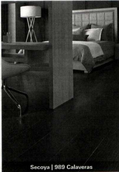
Secoya | 989 Calaveras

Secoya and Bolder Hot & Heavy floating resilient tile lives up to its name. The bold, oversized formats are the hottest products in the industry and are made possible by the loose lay construction. Each jumbo tile and plank is coated with a non-skid backing that together with the substantial weight of the product keeps tiles on the floor under heavy commercial traffic. Hot & Heavy not only looks amazing but works to reduce sound transfer and substantially reduce subfloor prep for a fashionable, practical commercial flooring solution.